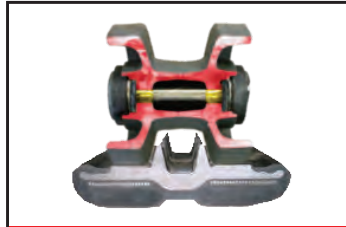
Steel on Steel