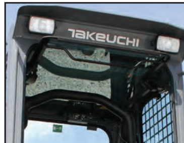
Roll Up Door