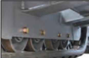
Fully Welded Frame