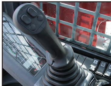
Pilot Operated Controls