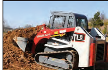
Active Power Control