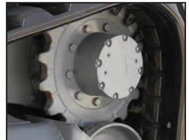
Double Reduction Drives