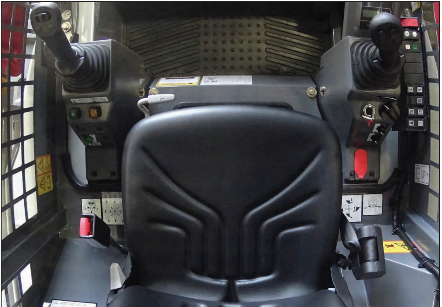
Spacious operator's platform with easy to reach controls and switches.

The TL8 offers a heavy duty rear door that swings out providing access to the high capacity cooling module while the tilt back cab / canopy provide access to the clustered engine oil filter, primary, and secondary fuel filters, pump group, control valve, and pilot line filter. Takeuchi quality and functionality ensures the TL8 will deliver many years of trouble free service in the most extreme conditions.