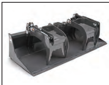
Grapple - Scrap

Takeuchi now offers attachments for all of your Takeuchi equipment. See your authorized Takeuchi dealer for additional information and attachment options.