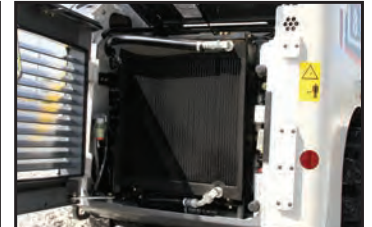
HD Cooling Module

Powerful and efficient, the TL8 is engineered to provide excellent maneuverability, performance, and value. The heavy duty cross member, two-speed travel, and hydraulic self-leveling are standard equipment on the TL8. Operator controls include a multi-function display, hydraulic pilot controls, foot throttle, and a high back suspension seat. The TL8 provides ample space and comfort for your time on the job.