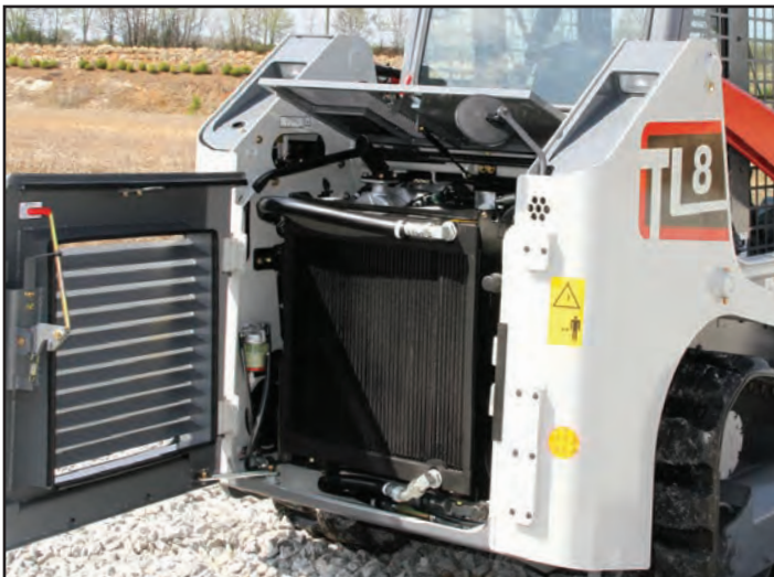
Convenient Service and Maintenance Access